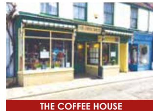
THE COFFEE HOUSE