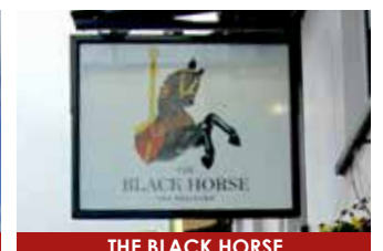
THE BLACK HORSE