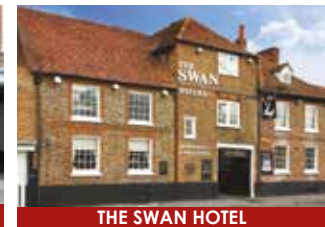
THE SWAN HOTEL