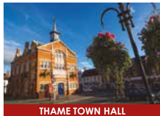
THAME TOWN HALL